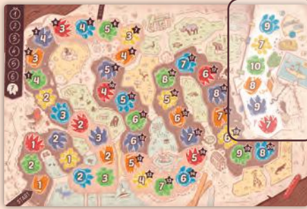
Front: standard game