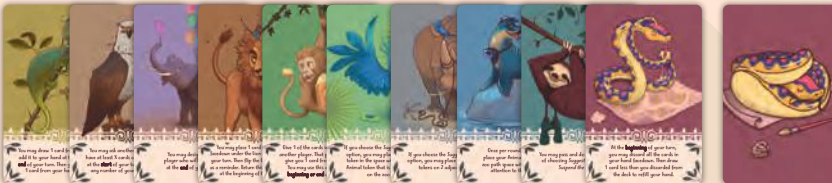
Front with a brief explanation of the animal's special ability