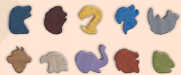
(12 per Animal)