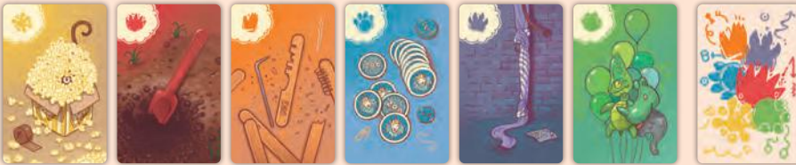
6 Popcorn Box 7 Ice Cream Spoon 8 Popsicle Sticks 9 Coins 10 Scarves 11 Balloons Back